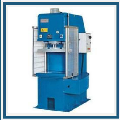
Semi Automatic Hydraulic Press Machine