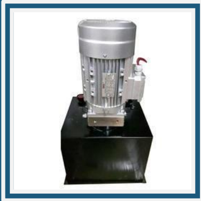
Hydraulic Compact Power Pack