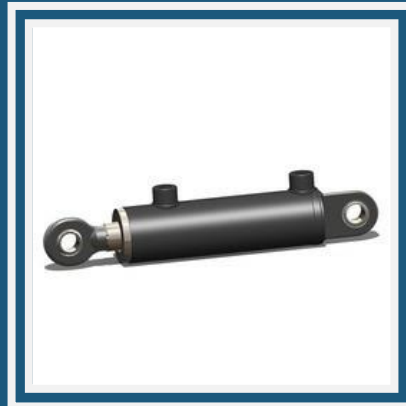
Double Acting Hydraulic Cylinder