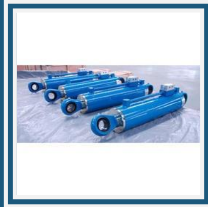
Hydraulic Oil Cylinder