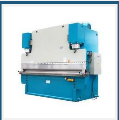
Automatic Hydraulic Bending Machine