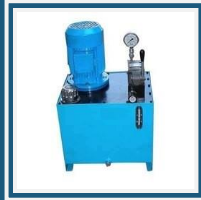
Hydraulic Power Pack Unit