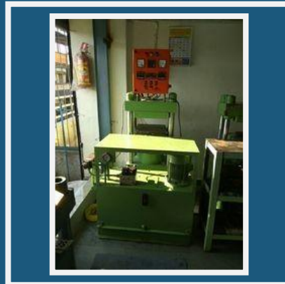
Automatic Hydraulic Press Machine