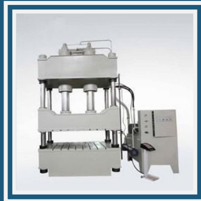
Dish End Hydraulic Pressing Machine