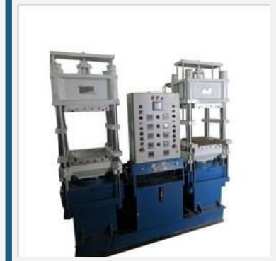
Hydraulic Rubber Moulding Press Machine