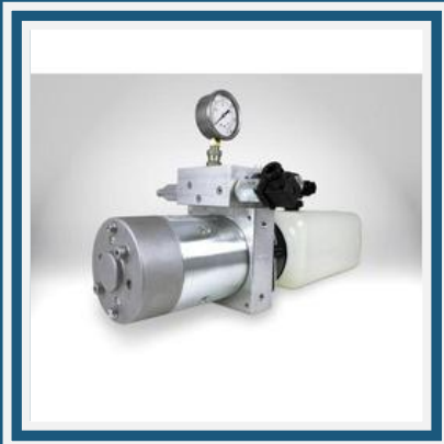
Mini Hydraulic Power Pack