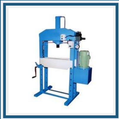
Automatic Hydraulic Press Machine