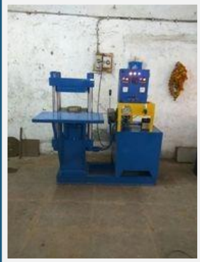
Hydraulic rubber molding Machine