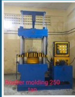
rubber moulding machine