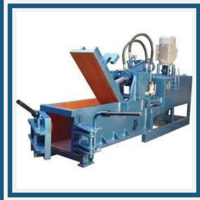
Hydraulic Press Machine